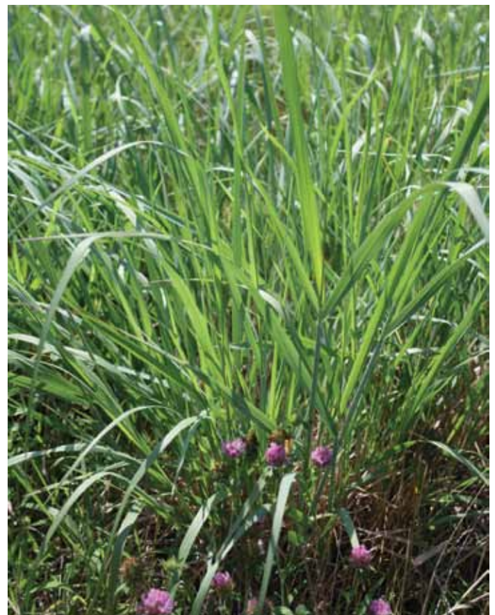
Figure 4. Red clover flowering in a switchgrass pasture

with respect to establishment and persistence during trials at the University of Tennessee.